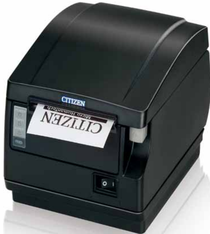
CT-S651 (available in black or white)