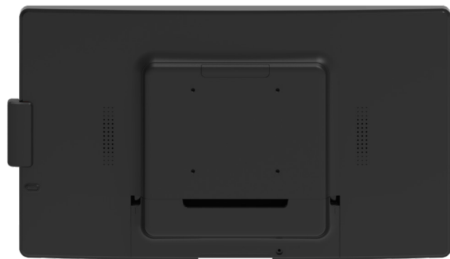
SLIM, DURABLE DESIGN

With a sleek slim design (37.9mm width) the fanless J1900 CPU, noise-free Panel PC is capable of multi roles such as Kitchen Video System (KVS), Self-Check In and Self-Check Out, Self Service Terminals (Self Ordering), or act as Digital Signage Display / Information Display.