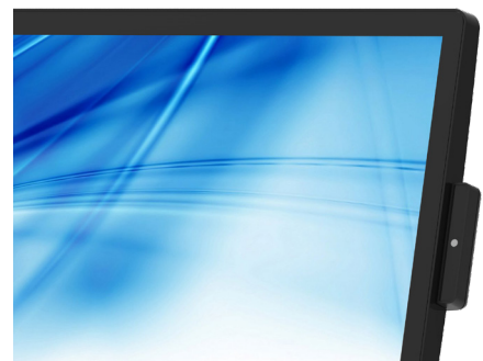
MODULAR FRONT CAMERA