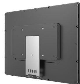
VESA MOUNT 100 X 100MM