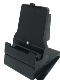
G10s Office Dock