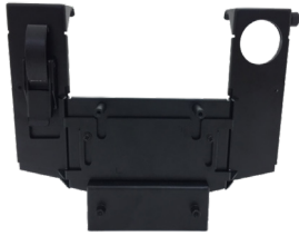
G8s Vehicle Mount