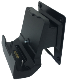
G8s VESA Mount Charger