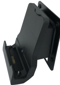
G10s VESA Mount Charger