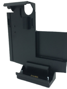
G10s Vehicle Mount