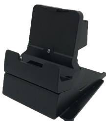
G8s Office Dock