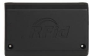
HF RFID Reader