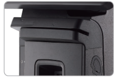
Optional Built-in MSR, Smart Card Reader, Fingerprint Sensor and RFID Reader