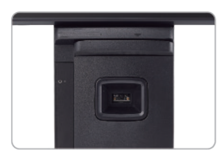
2D Barcode Scanner

Dressed from head to toe in timeless black or white color, the only trend that never goes out of style, and with stylish touches added throughout, the HS-2500W-2D Series is not just a piece of machinery, it is an elegantly crafted piece of art that looks right at home in any store decoration.